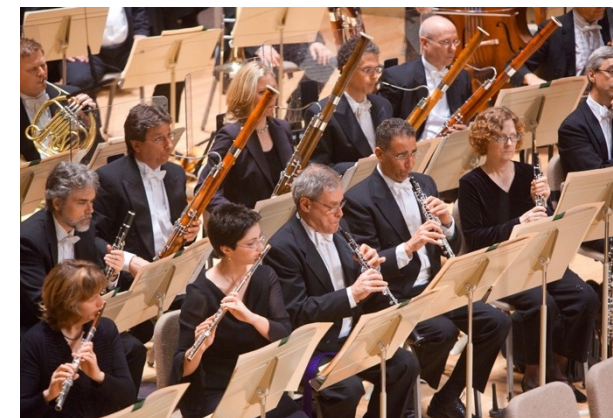
*Subject to change